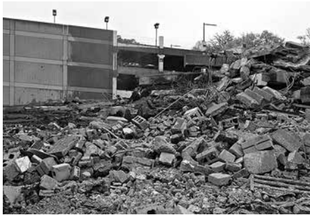
Work began in earnest with the demolition of the old garage.

Village about incorporating the public garage into a major project.