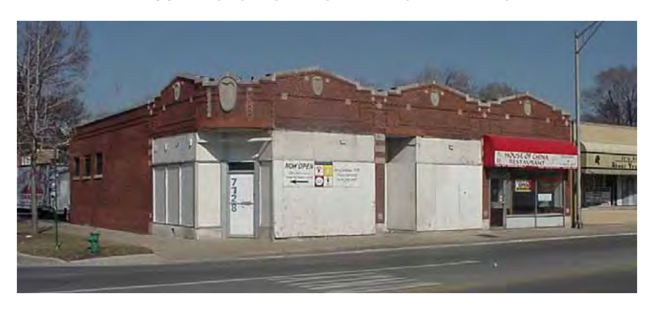
7128 Roosevelt Road

(COMMERCIAL REHABILITATION) Salerno's Pizza & Pasta Restaurant (owners) MFC Builders (contractor)