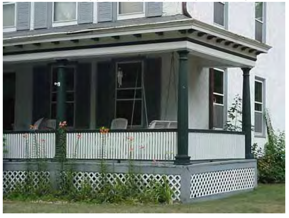
241 Home Avenue