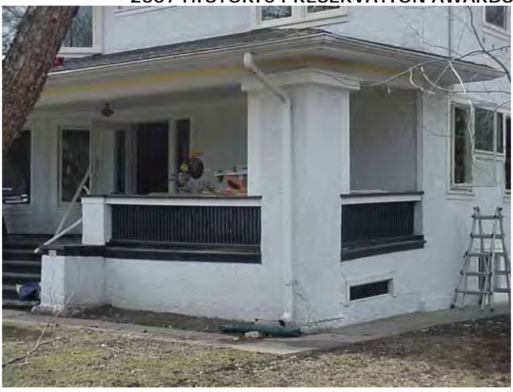
619 Fair Oaks Avenue